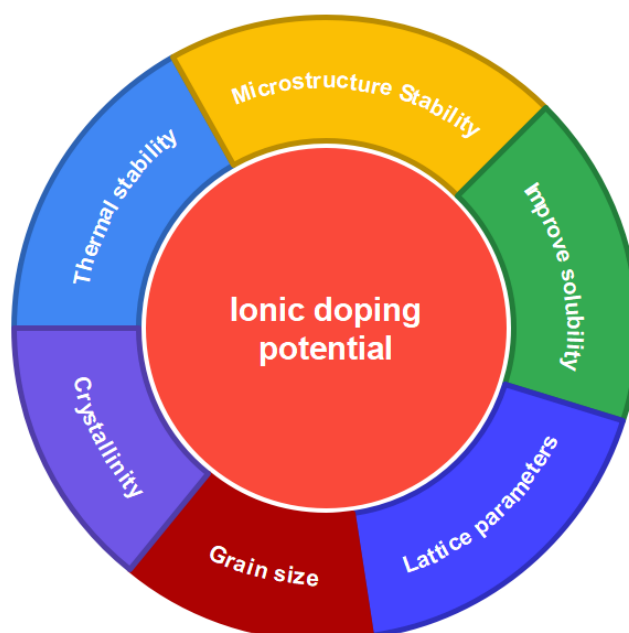
Figure 2. Ionic doping potential

As shown in Figure 2, single ionic doping can change the parameters of the HAp structure. These changes are dependent on the quantity and length of the dopant. As a direct consequence of this, a great number of research projects focusing on the production of single ion-doped HAp have been carried out. When it came to the synthesis and subsequent structural characterization, it was determined that single ion doping in the HAp structure was the simplest option [104,105]. As a coating material for biomedical implants, we will explore the effects of single ion doping on HAp structure in the following sections. Particular attention will be paid to coatings applied using plasma spraying when this method is most applicable.